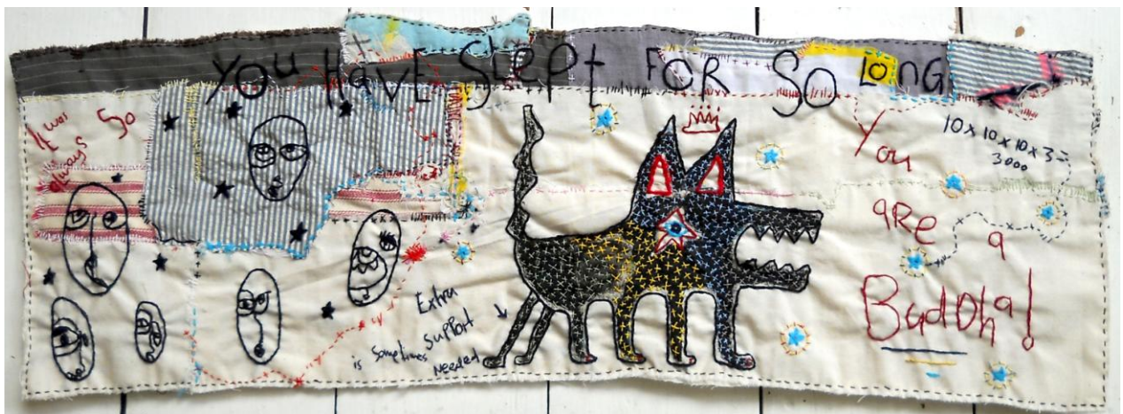
Wake Up!!!, mixed textiles, hand embroidery, black ink, 24x69

Trägerverein: PS-Art e.V. Berlin Oranienburger Straße 27 10117 Berlin-Mitte