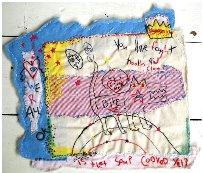
Is it cooked yet, mixed textiles, hand embroidery, acrylic, 28x30

Trägerverein: PS-Art e.V. Berlin Oranienburger Straße 27 10117 Berlin-Mitte