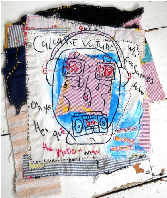
Modern Man, mixed textiles hand embroidery, acrylics, 33x28,

For printable image material please contact: galerie@art-cru.de