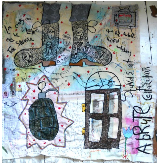
Brute Force, mixed textiles, hand embroidery, acrylics, 72x75