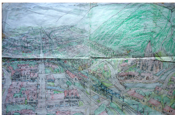
M. Golz: Sausberg II im Athosland, 2005, drawing on paper, 65,5x49,5