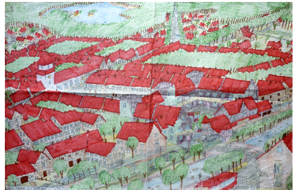
M. Golz: Wellingdorf II im Athosland, 2008, drawing on paper, 65,5x49,5cm