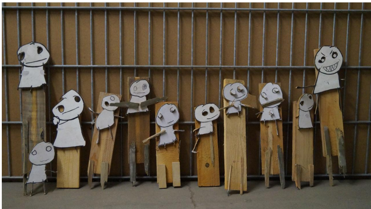
Christo Lufundiso Luanza, Single figures, 2015, MDF-figures, wood, aprox. 30 - 50cm