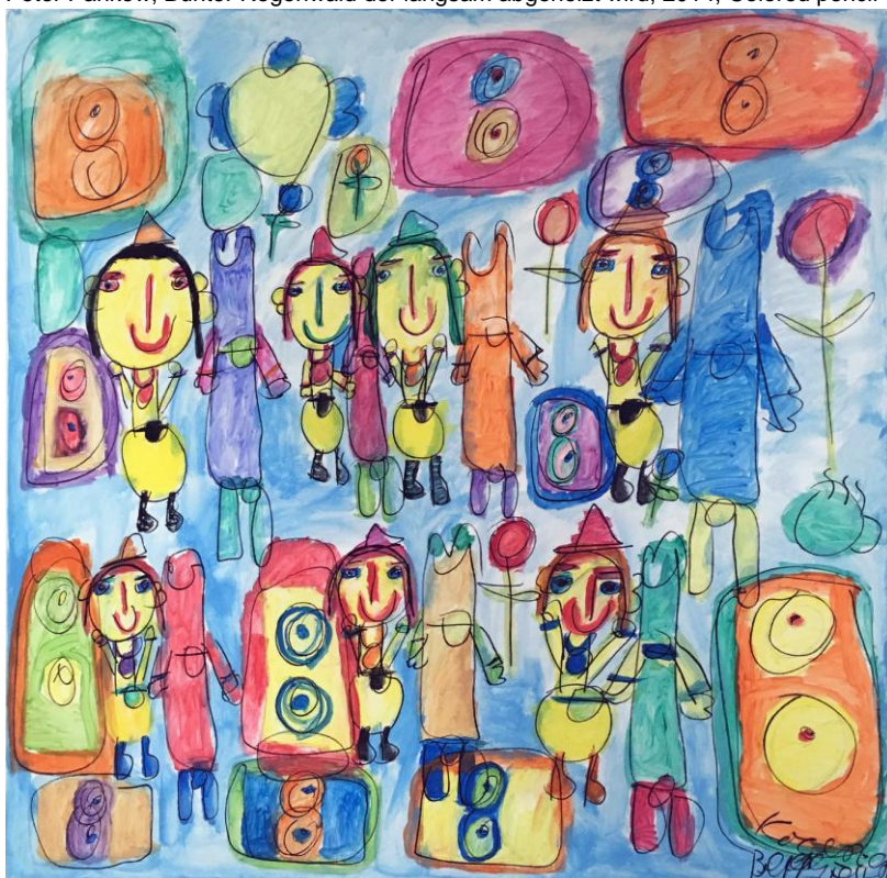
Betty Feix, Konzert, 2018, acrylic on canvas, 100x100