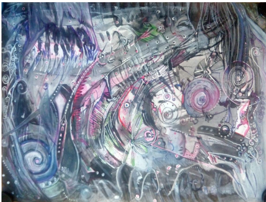
Melanie Edwards, Sanfte Spiralen in Grau, 2018, mixed media, ink, acrylic, tipp-ex, ballpoint pen