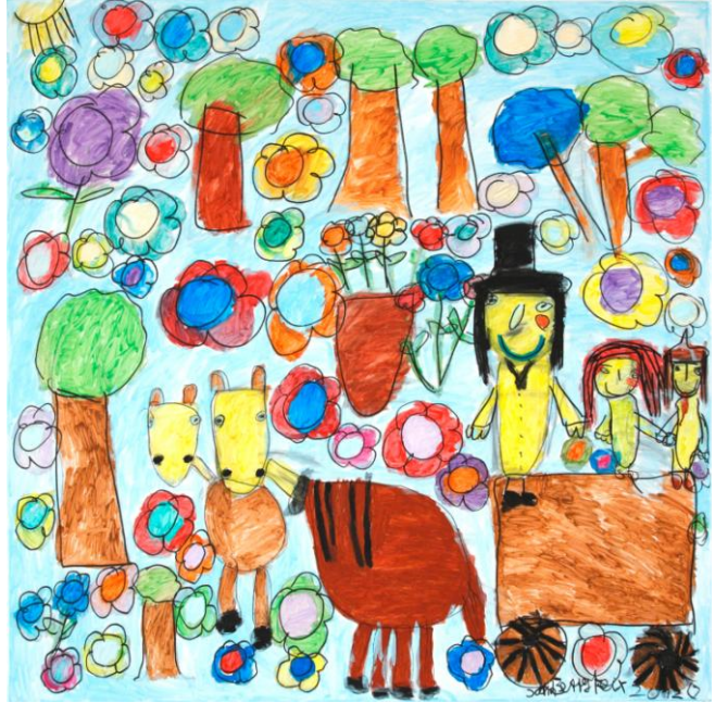
Betty Feix, Hochzeitskutsche, 2012, mixed media, 100x100