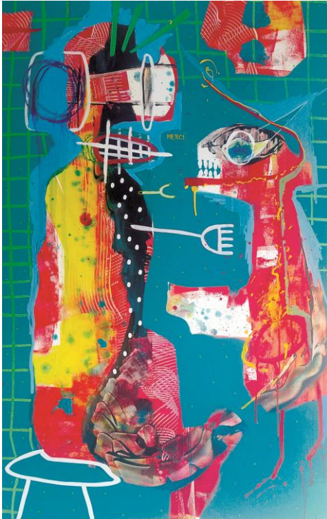
Untitled, 2014-2018 mixed media, 116x73

For printable image material please contact: galerie@art-cru.de