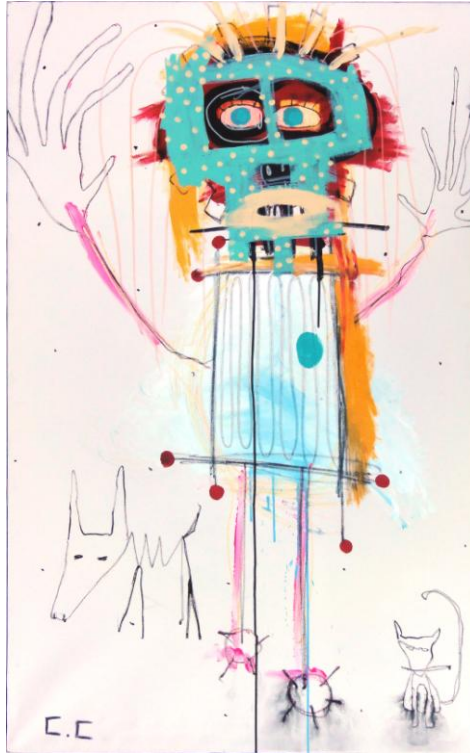
Untitled, 2014-2018 mixed media, 116x73