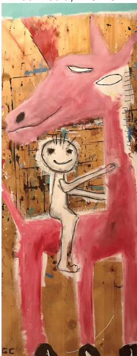
Untitled 2014-2018 mixed media, 120x40