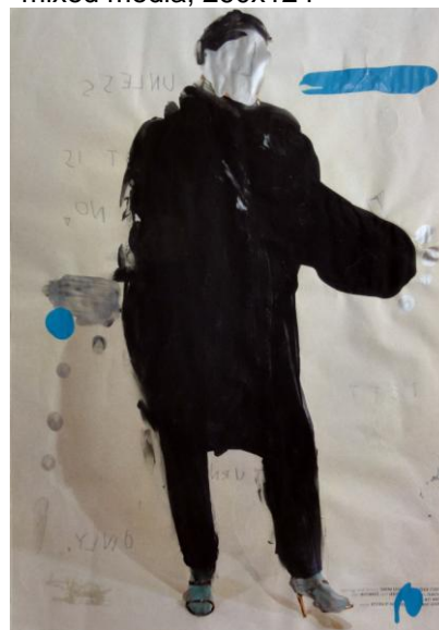
Guthrie McDonald, get lucky 1, 2020 overpainting, 40x30

Trägerverein: PS art e.V. Berlin Oranienburger Str. 27 10117 Berlin