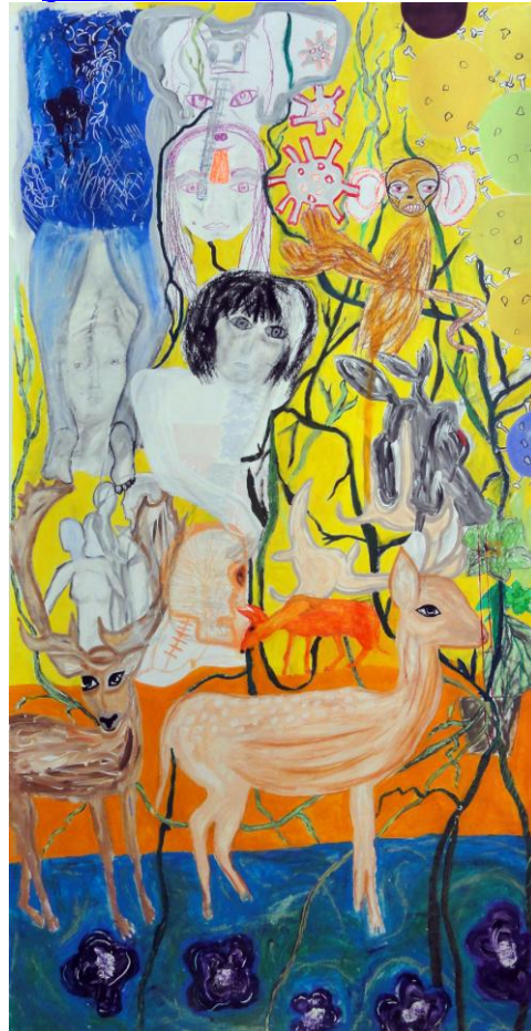
Belhe Zaimoglu, Corona, 2020 mixed media, 260x124