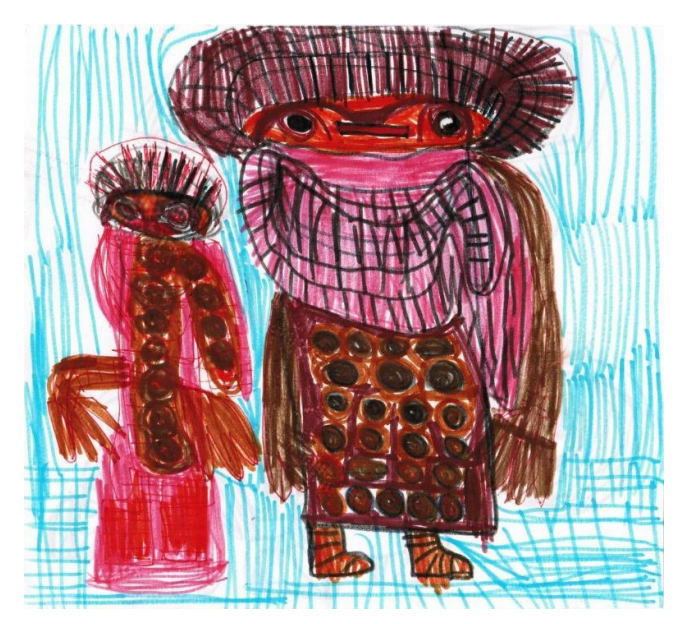
O.T., o.D., fiber pen, ballpoint pen, 20x22