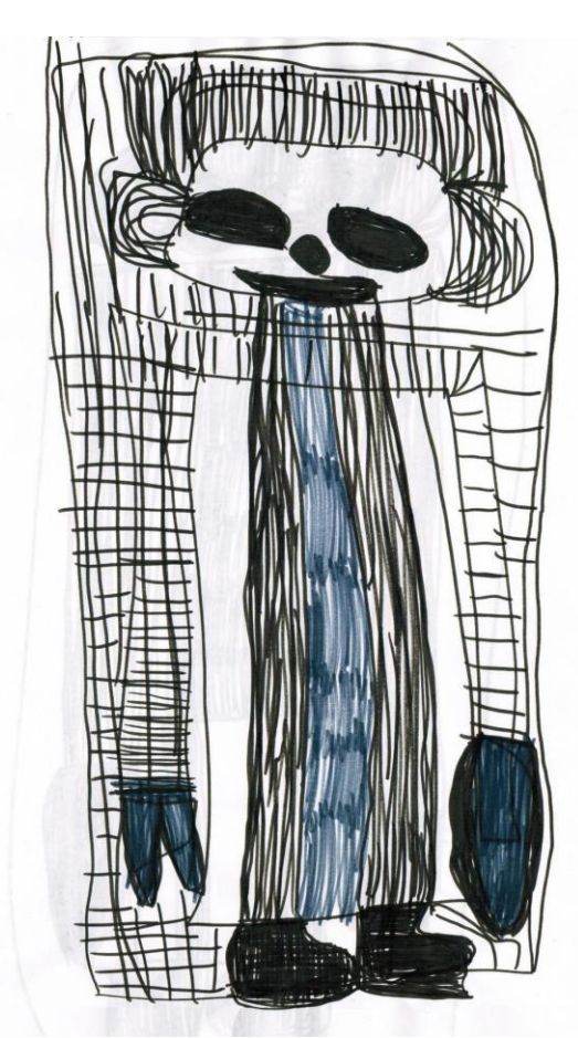
O.T., o.D., fiber pen, 42x30

GALERIE ART CRU BERLIN · ORANIENBURGER STRASSE 27 · 10117 BERLIN-MITTE 0049 (0)30 / 24 35 73 14 · GALERIE@ART-CRU.DE · WWW.ART-CRU.DE