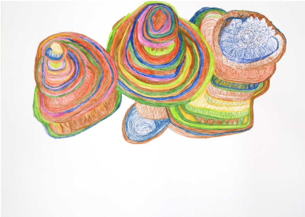
Heidi Bruck, untitled, 2015, colored pencil, 70x100