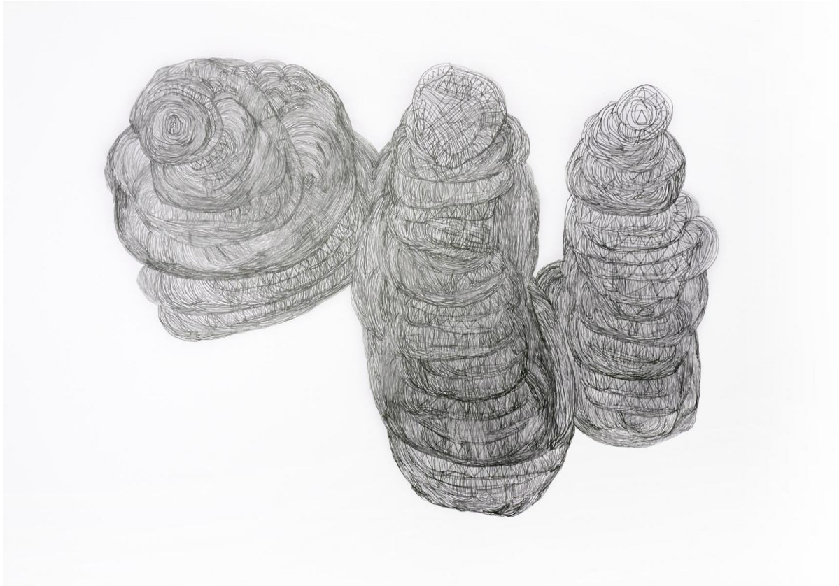
Heidi Bruck, untitled, 2015, pencil, 70x100

For printable image material please contact: galerie@art-cru.de