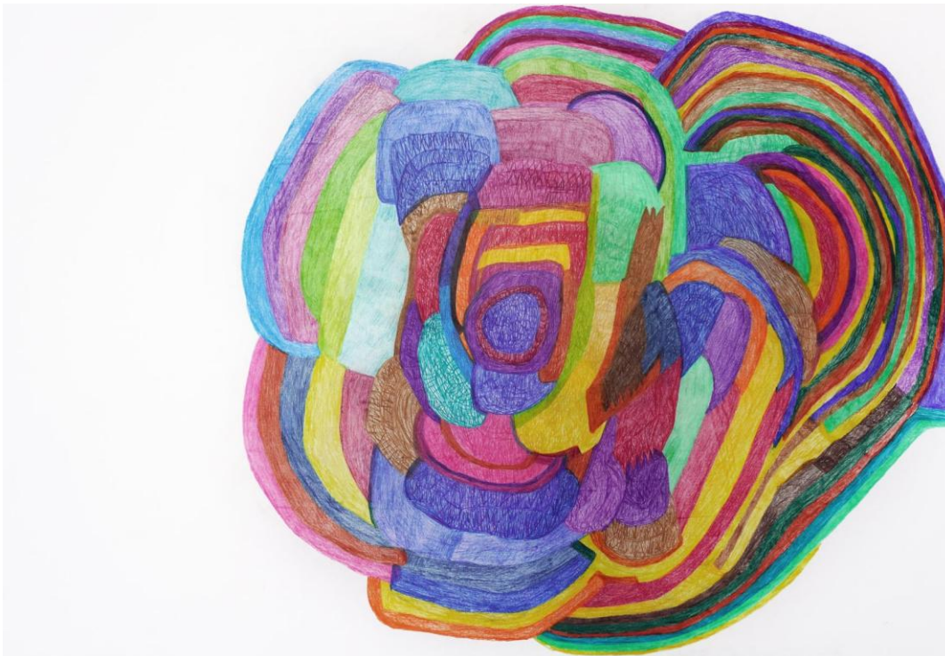
Heidi Bruck, untitled, 2021, colored pencil, 70x100