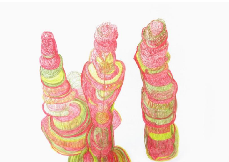
Heidi Bruck, untitled, 2014, colored pencil, 70x100

Trägerverein: PS art e.V. Berlin Oranienburger Straße 27 10117 Berlin-Mitte