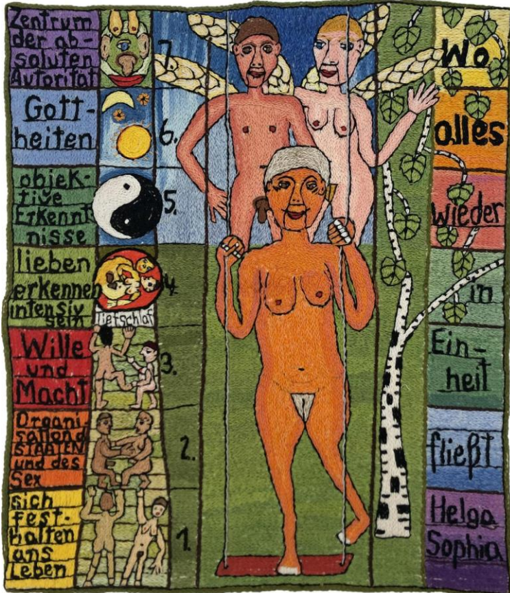
Yoga, undated, cotton twist, metal threads, nettle, 47x39,7

For printable image material please contact: galerie@art-cru.de