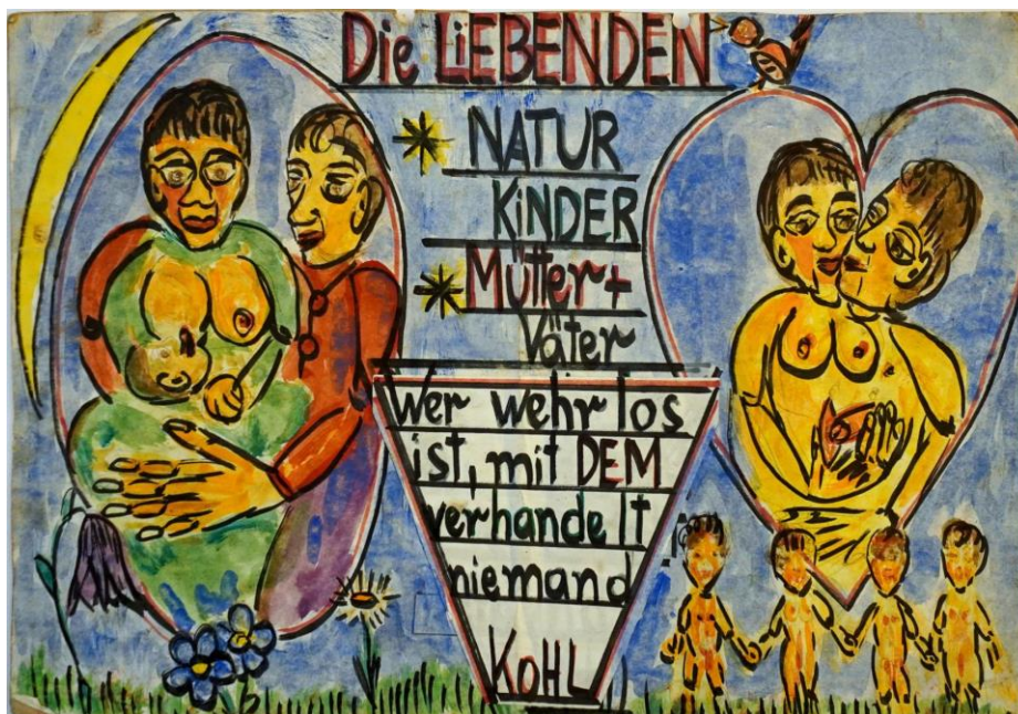
Die Liebenden, undated, gouache, 21x30

Trägerverein: PS art e.V. Berlin Oranienburger Straße 27 10117 Berlin-Mitte