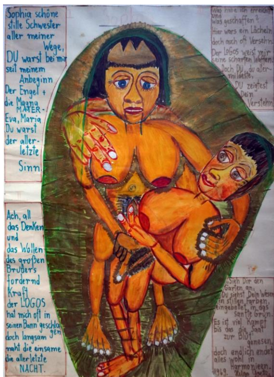
Sophia schöne stille Schwester, 1969, gouache, 63x54, picture credit: Karin Pott / Galerie ART CRU Berlin

Trägerverein: PS art e.V. Berlin Oranienburger Straße 27 10117 Berlin-Mitte