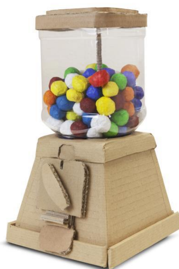
Chewing gum machine, 2017 cardboard, 30x17,5x16,5

Trägerverein: PS-Art e.V. Berlin Oranienburger Straße 27 10117 Berlin-Mitte