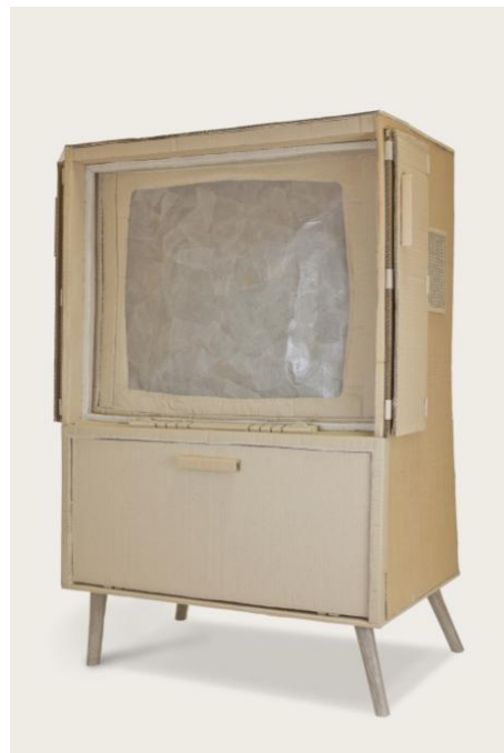
TV with doors, 2017 cardboard, 67 x 63 x 50 cm