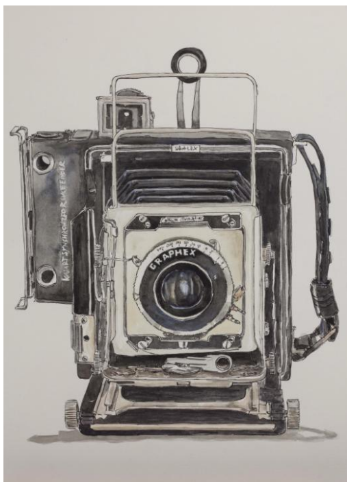
untitled., 2019 watercolors, ink on cardboard, 42,1x29,7