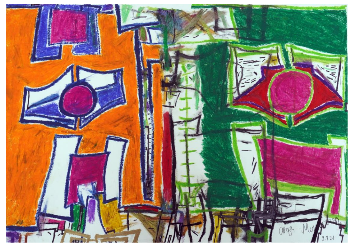
Olga Mezenceva, untitled, 2021, oil pastel, fineliner, colored pencil, marker on paper, 43x61

Trägerverein: PS-Art e.V. Berlin Oranienburger Straße 27 10117 Berlin-Mitte