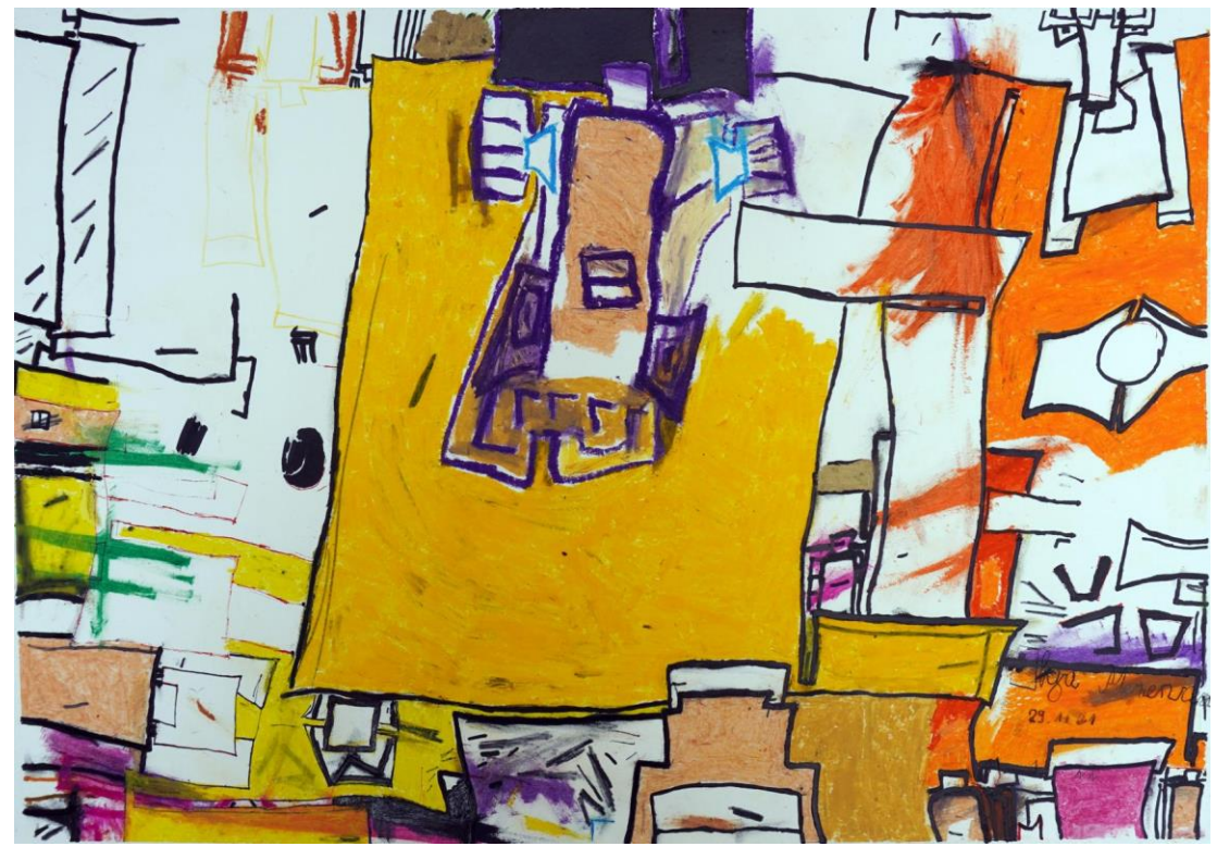
Olga Mezenceva, untitled, 2021, oil pastel, fineliner, colored pencil, marker on paper, 43x61

GALERIE ART CRU BERLIN · ORANIENBURGER STRASSE 27 · 10117 BERLIN-MITTE 0049 (0)30 / 24 35 73 14 · GALERIE@ART-CRU.DE · WWW.ART-CRU.DE