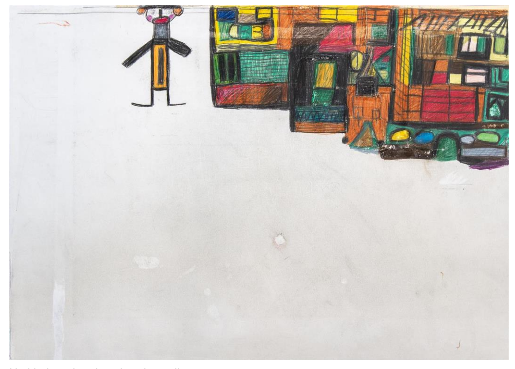
Untitled, undated., colored pencil, 70x50