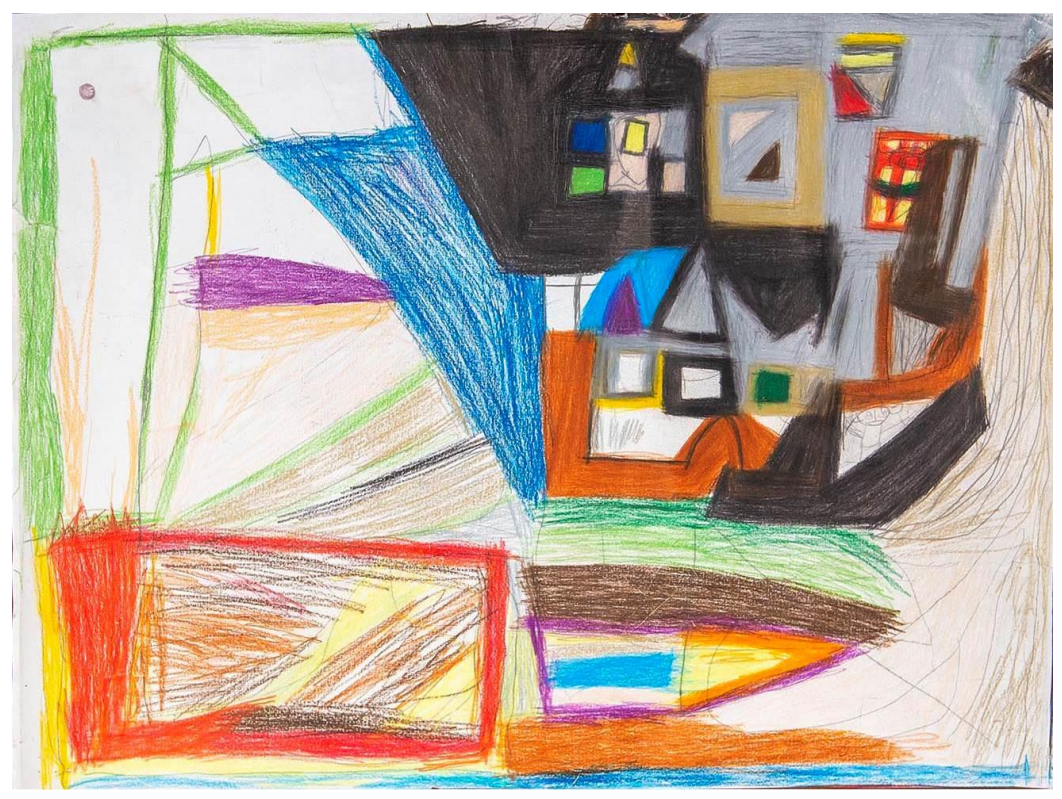
Hotel mit Badewanne und Vollpension, undated, colored pencil and pencil, 51x38