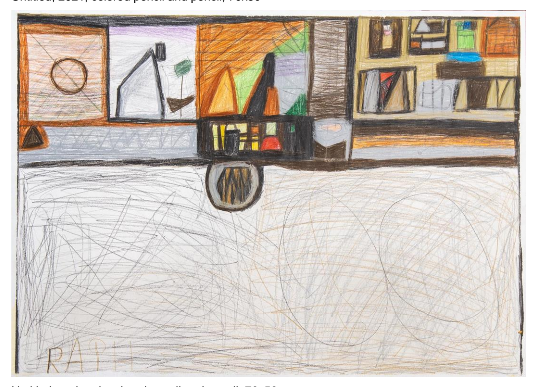
Untitled, undated, colored pencil and pencil, 70x50