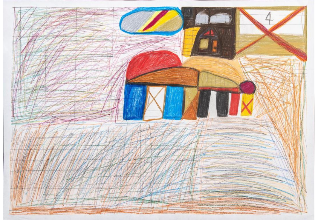
Blitz+Donner, ein Bauernhaus, die Berge, verboten, schwarze Tone und ein Muster, 2019, colored pencil and pencil, 70x50