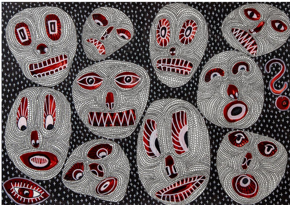
O.T., 2020, mixed media, 29,5x42

Trägerverein: PS-Art e.V. Berlin Oranienburger Straße 27 10117 Berlin-Mitte