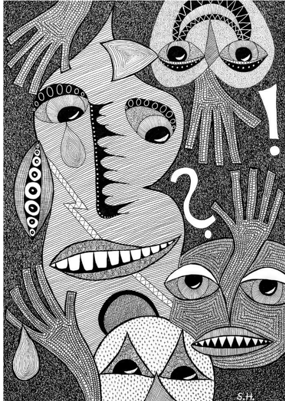
O.T., 2020, mixed media, 42x29,5