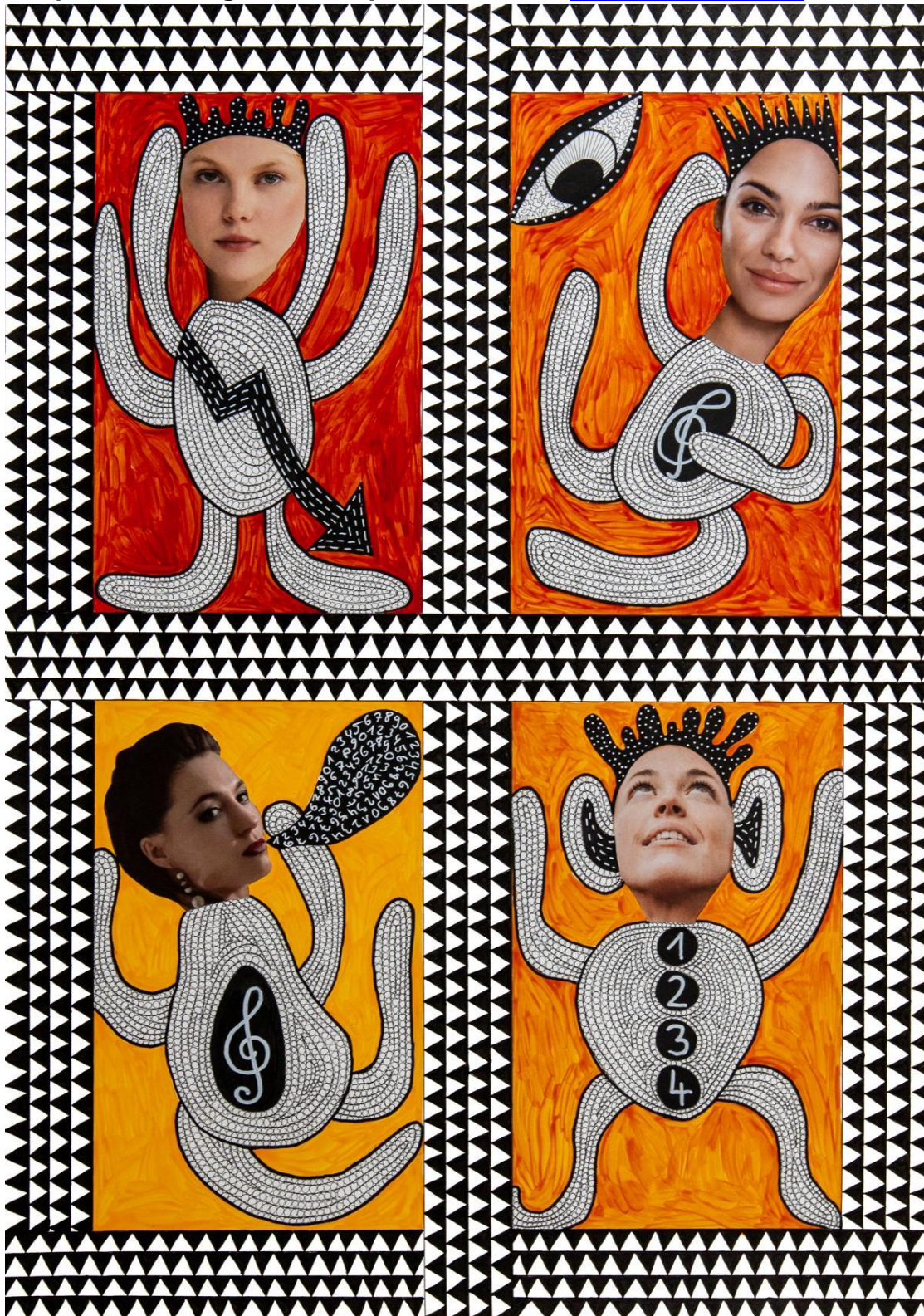
Mittsommer, 2022, mixed media, 59,5x42

For printable image material please contact: galerie@art-cru.de