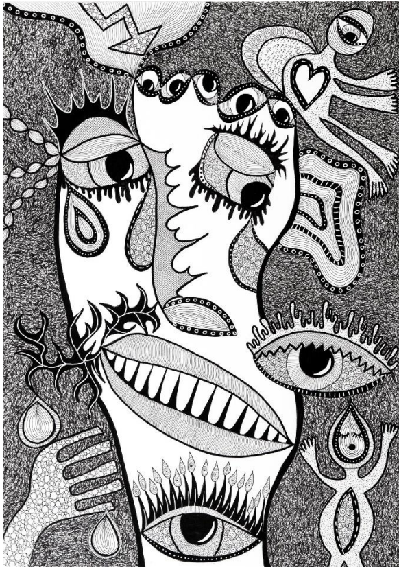
Wohin?., 2023, mixed media, 42x29,5