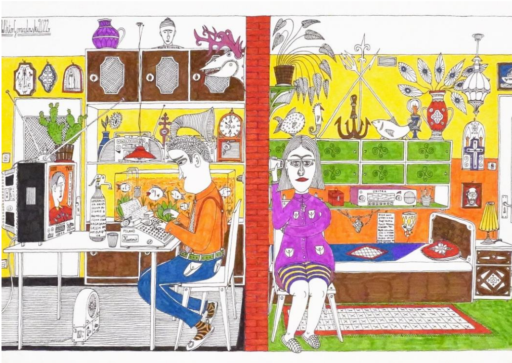
Wiktor Gorazdowski, The knock of tapemachine, heart beat, 2022, Fineliner, Fasermaler, 30x42