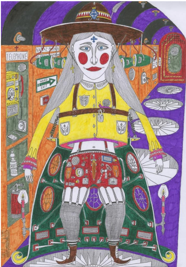
Wiktor Gorazdowski, The woman on the border between reality and dream, 2023, fineliner, marker, 42x30

Trägerverein: PS-Art e.V. Berlin Oranienburger Straße 27 10117 Berlin-Mitte