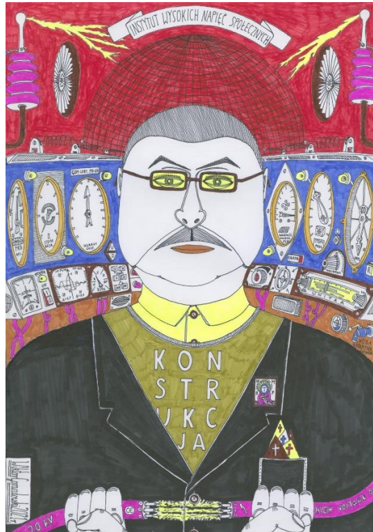
l: Wiktor Gorazdowski, Automatical haircutting systems, 2020, fineliner, marker, 42x30