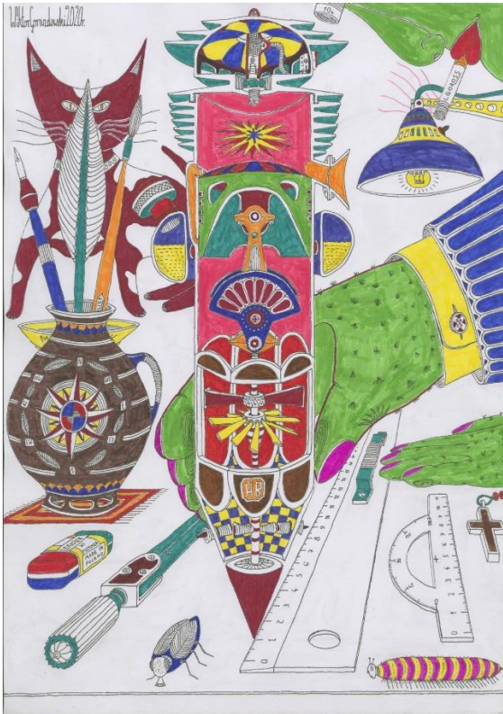
Wiktor Gorazdowski, Magic pencil vertical, 2020, Fineliner, Fasermaler, 42x30