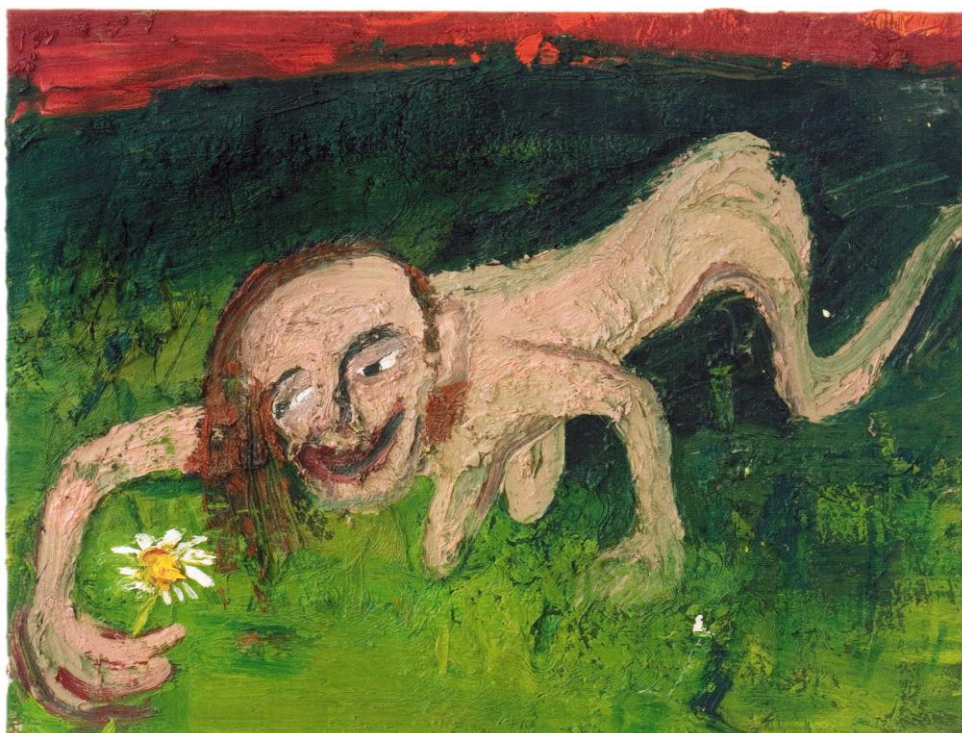
Norman Seibold, O.T., 1998, oil on canvas, 90x120 Copyright SeiNo-Stiftung, Courtesy Galerie ART CRU Berlin