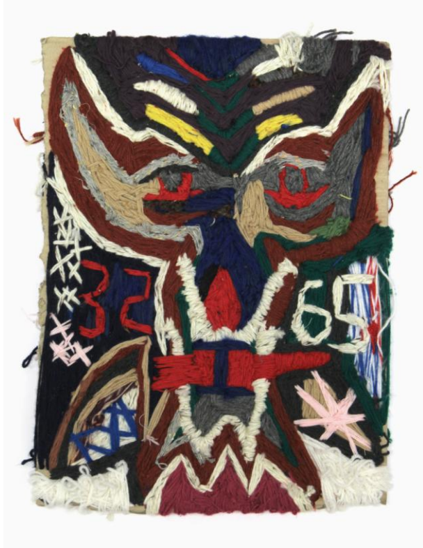
Oliver Rincke, 32,65, 2016, cardboard, wool, 54x39 Copyright Thikwa Werkstatt für Theater und Kunst, Courtesy Galerie ART CRU Berlin

Trägerverein: PS-Art e.V. Berlin Oranienburger Straße 27 10117 Berlin-Mitte